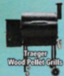
Traeger Wood Pellet Grills

Dealer for ... • Napoleon BBQ • Traeger Grills • Norco Bike • Beauti-tone Paint • Scotts Lawn Care • Recycled Poly Lawn Furniture • Window and Screen Repair • Bike Repair • Skate, Knife and Scissor Sharpening • Water Testing & Pool / Spa Chemicals