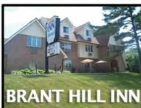
BRANT HILL INN